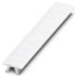
Zack marker strip, Can be ordered: Strip, white, Labeled according to customer specifications, Mounting type: Snap into tall marker groove, For terminal block width: 6.2 mm, Lettering field: 6.15 x 10.5 mm

Marker for terminal blocks - UC-TM 6 CUS - 0824589