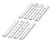
Zack Marker strip, flat, Can be ordered: Strip, white, Labeled according to customer specifications, Mounting type: Snap into flat marker groove, For terminal block width: 6.2 mm, Lettering field: 5.15 x 6.15 mm

Zack Marker strip, flat - ZBF 6 CUS - 0825027