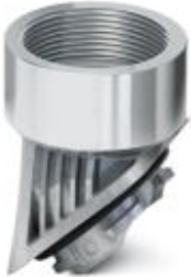
Adapter, aluminum, for EVO housing, M25 thread

Please be informed that the data shown in this PDF Document is generated from our Online Catalog. Please find the complete data in the user's documentation. Our General Terms of Use for Downloads are valid ( http://phoenixcontact.com/download )